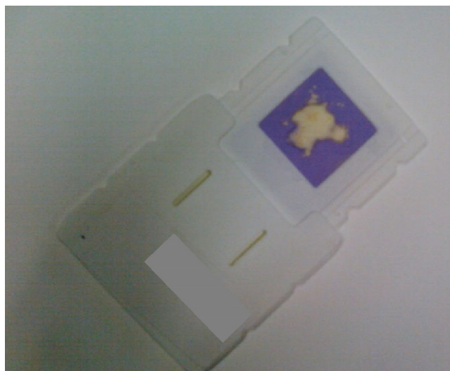
FIG. 2. Whatman indicating FTA elute cartridge upon application.

Sample set 1. Between September and October 2008, 45 women were recruited at the Department of Obstetrics and Gynecology of the Radboud University Nijmegen Medical Centre, The Netherlands. These participants visited the gynecologist for follow-up after diethylstilbestrol exposition in utero, treatment of cervical dysplasia, or follow-up after two borderline or mild dysplasia